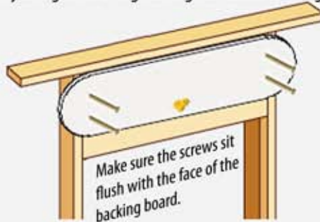
Make sure the screws sit flush with the face of the backing board.

Attach the holds with the bolts using the Allen key wrench (the wrench can sit in the hole on top of the board when you are not using it). Look on the back of the holds for left and right markings. To adjust the holds: loosen the bolt with a half twist anti-clockwise from the wrench, move to the desired position and re-tighten.